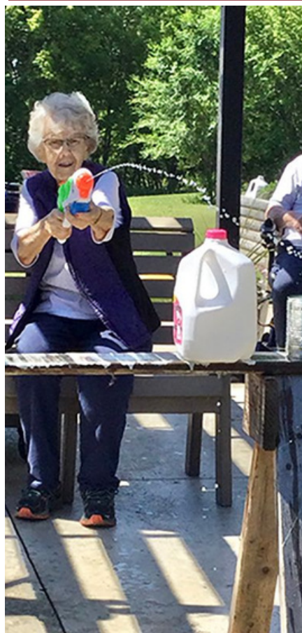
SUPER SOAKER SHOOT-OUT FUN AT HOLLY RIDGE MANOR!