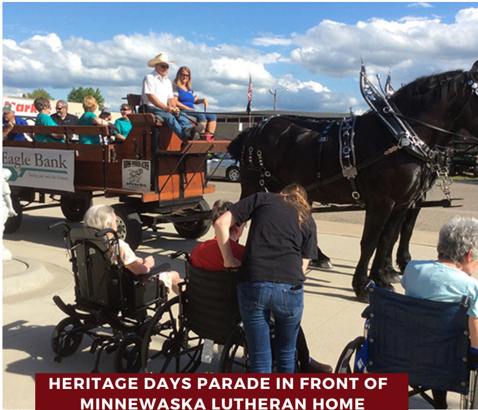
HERITAGE DAYS PARADE IN FRONT OF MINNEWASKA LUTHERAN HOME