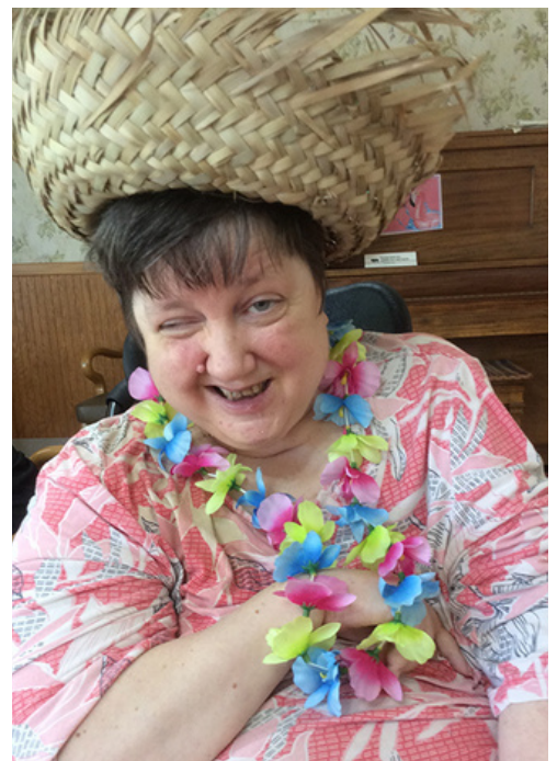
MLH HAD SOME TROPICAL FUN CELEBRATING NATIONAL FLAMINGO DAY AT THE END OF JUNE.