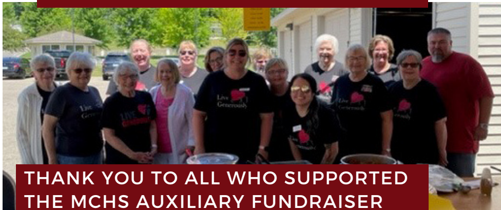
THANK YOU TO ALL WHO SUPPORTED THE MCHS AUXILIARY FUNDRAISER