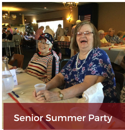
Senior Summer Party