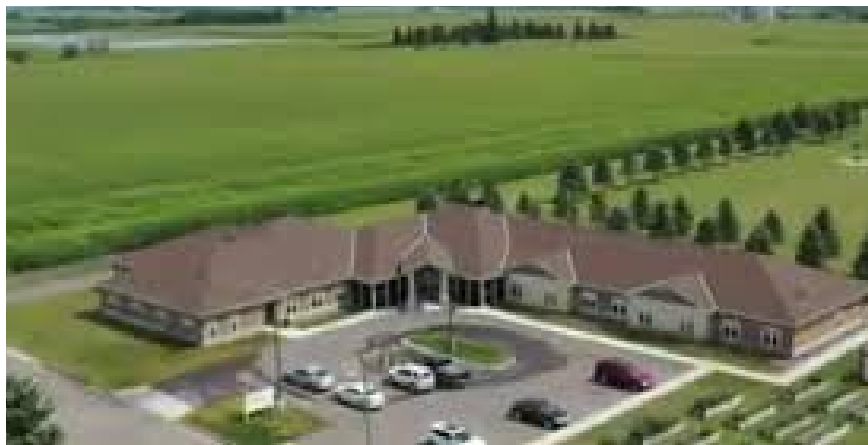
HOFFMAN SENIOR LIVING