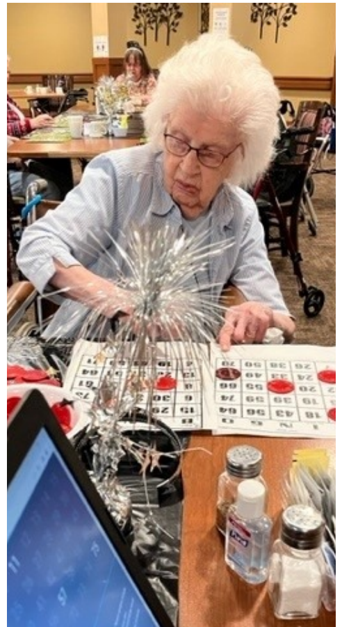
HOLLY RIDGE MANOR RESIDENTS HAD A FUN TIME CELEBRATING THE NEW YEAR! CHEERS TO 2023!