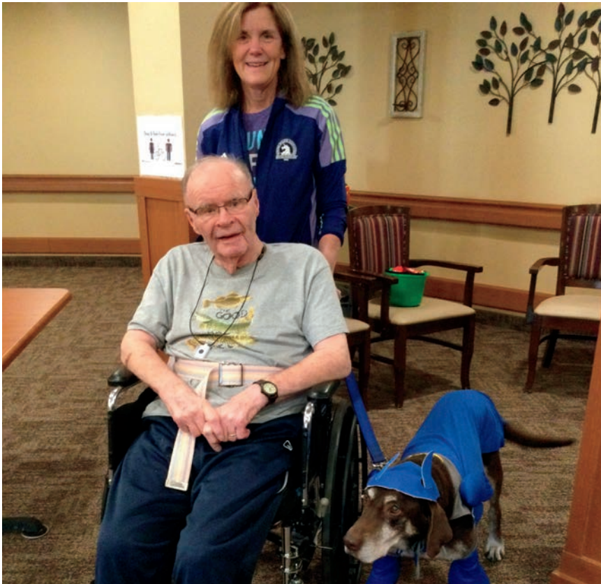
HOLLY RIDGE MANOR HAD A BUSY HALLOWEEN DAY FULL OF FUN AND TRICK OR TREATERS FROM GLACIAL HILLS ELEMENTARY SCHOOL