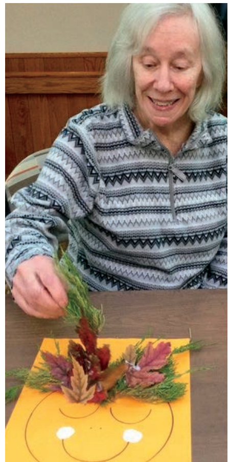
CRAFTING FUN AT GLACIAL TRAILS WITH LEAVES FROM OUTSIDE.