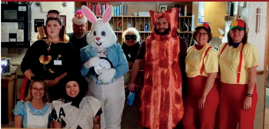
STAFF AT MLH HAD A BLAST CELEBRATING HALLOWEEN WITH THE RESIDENTS.